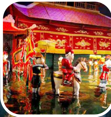
Water Puppet Performance