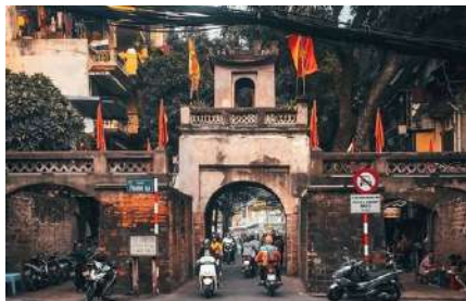
Hanoi Old Quarter