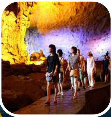
Thien Cung Cave

Note: Cruise itinerary may be changed without prior notice