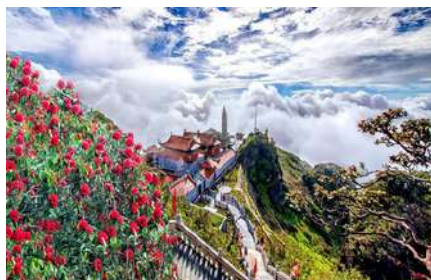
Rhododendrons bloom on the peak of Fansipan