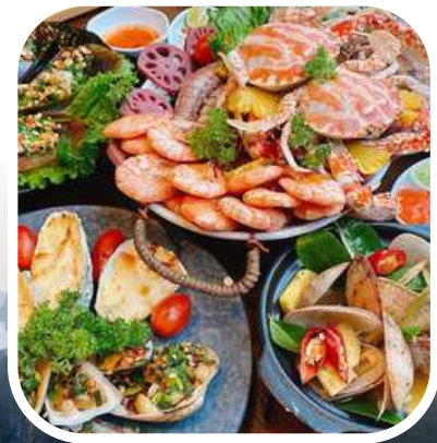
Seafood buffet dinner